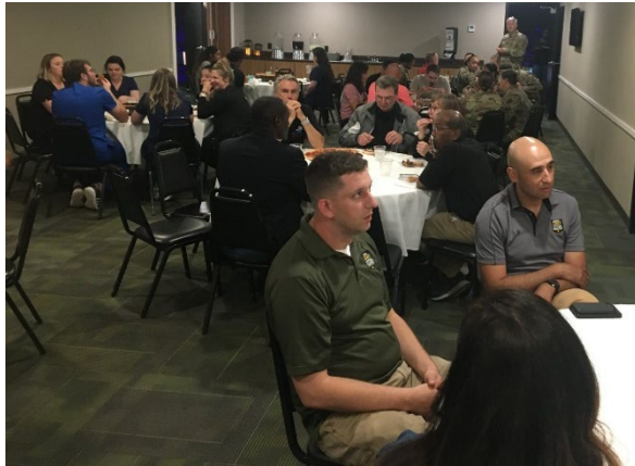
Rigby's Friday TX Social