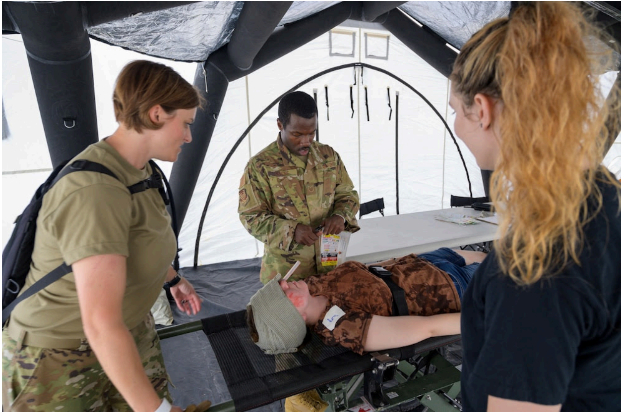
U.S. Airmen with the 116th Medical Group, Detachment 1, Georgia Air National Guard,... read more