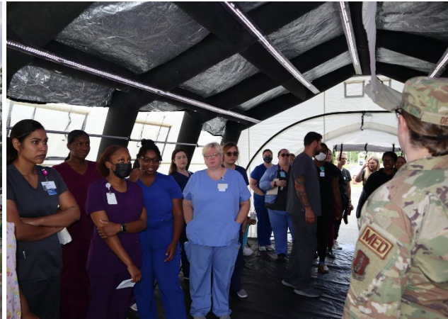
116 th MDG "Perry Hospital"