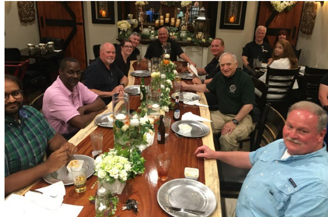
Pond Saturday TX Debrief